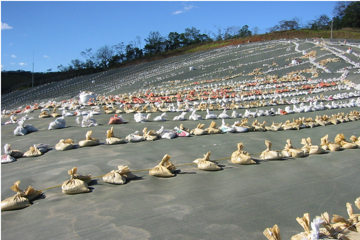
PHOTO 8 – HIGH WINDS REQUIRE SAND BAGS TO HOLD LINER UNTIL COVERED