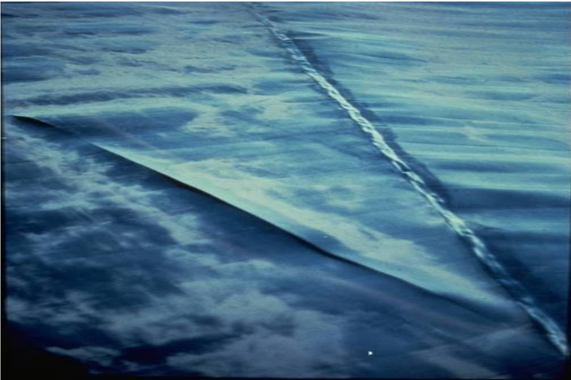
PHOTO 6 – STRESS CRACK IN HDPE LINER OCCURED ON LARGE EXPOSED PAD AREA