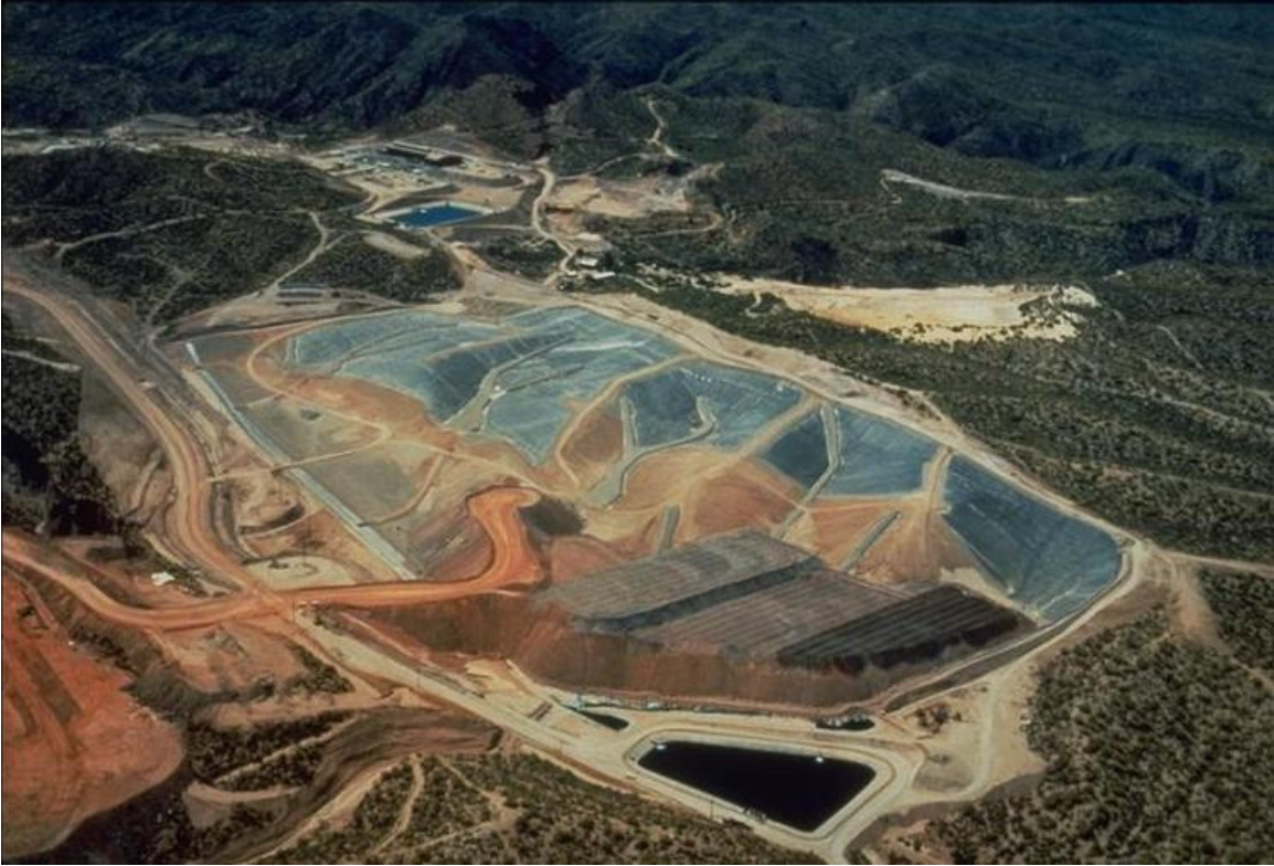
PHOTO 1 – GEOMEMBRANE LINED COPPER HEAP LEACH OPERATION IN ARIZONA