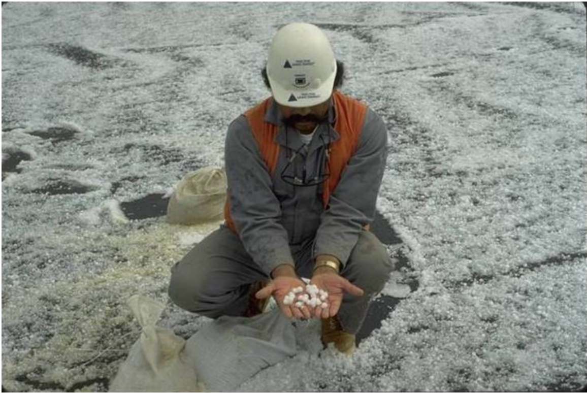
PHOTO 7 – HAIL AND BLAST FLY ROCK DAMAGE CAN OCCUR ON EXPOSED LINER